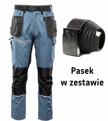
Pasek w zestawie